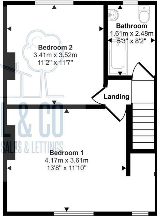
First Floor Approx 37 sq m / 403 sq ft

This floorplan is only for illustrative purposes and is not to scale. Measurements of rooms, doors, windows, and any items are approximate and no responsibility is taken for any error, omission or mis-statement. Icons of items such as bathroom suites are representations only and may not look like the real items. Made with Made Snappy 360.